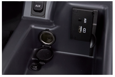
USB and Power Socket Power and USB sockets come standard to meet a variety of electrical needs.

The operator can simply engage the S-PTO switch whenever the operator needs to run PTO other than the seating position