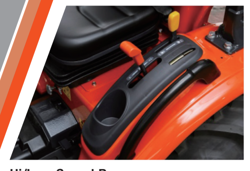
Hi/Low Speed Ranges The CX features a two range transmission (Hi/Low) to maximize performance and efficiency.